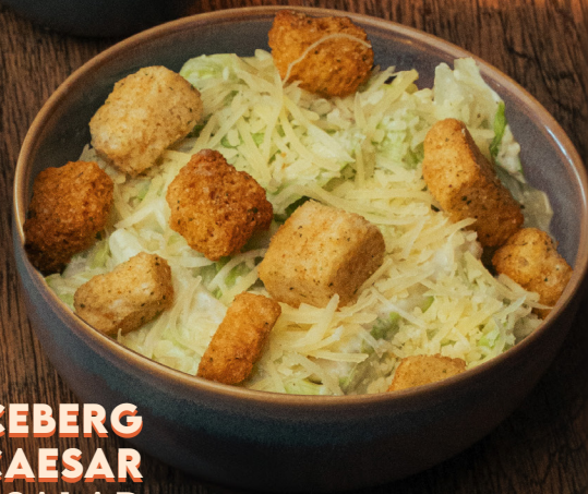
ICEBERG CAESAR SALAD