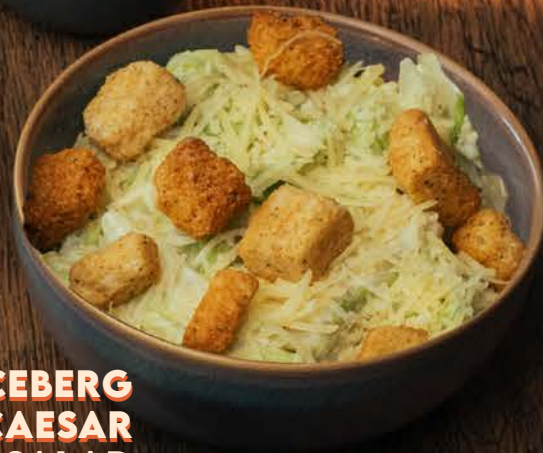
ICEBERG CAESAR SALAD