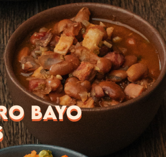
CHARRO BAYO BEANS